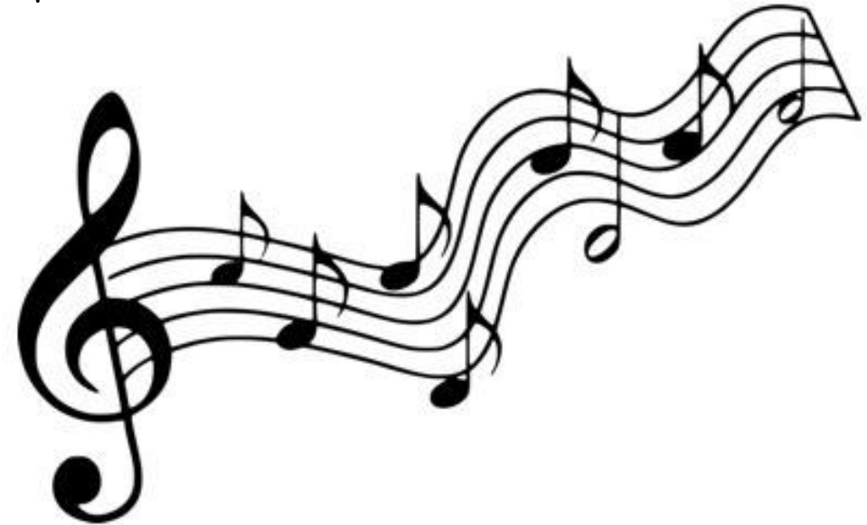
City Guard Band Free Concert