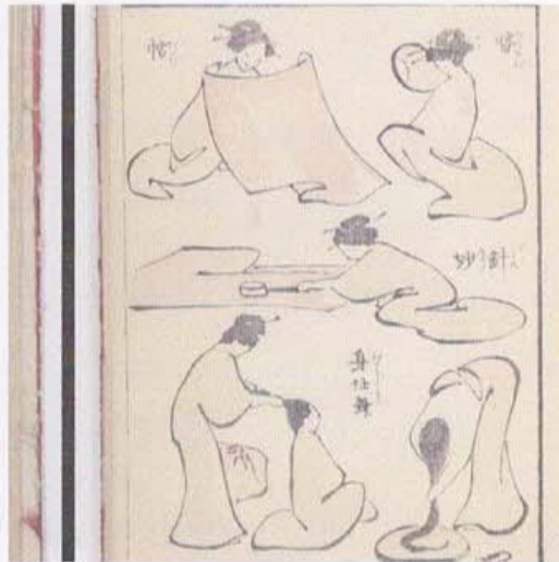
C: Hokusai One Stroke (2024).odt