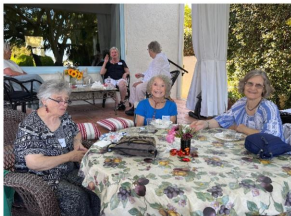
FRIENDS FROM LUNG HSIANG, OUR SISTER CHINESE BRUSH PAINTING SOCIETY.