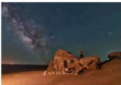
Milky Way Over Vermilion Cliffs