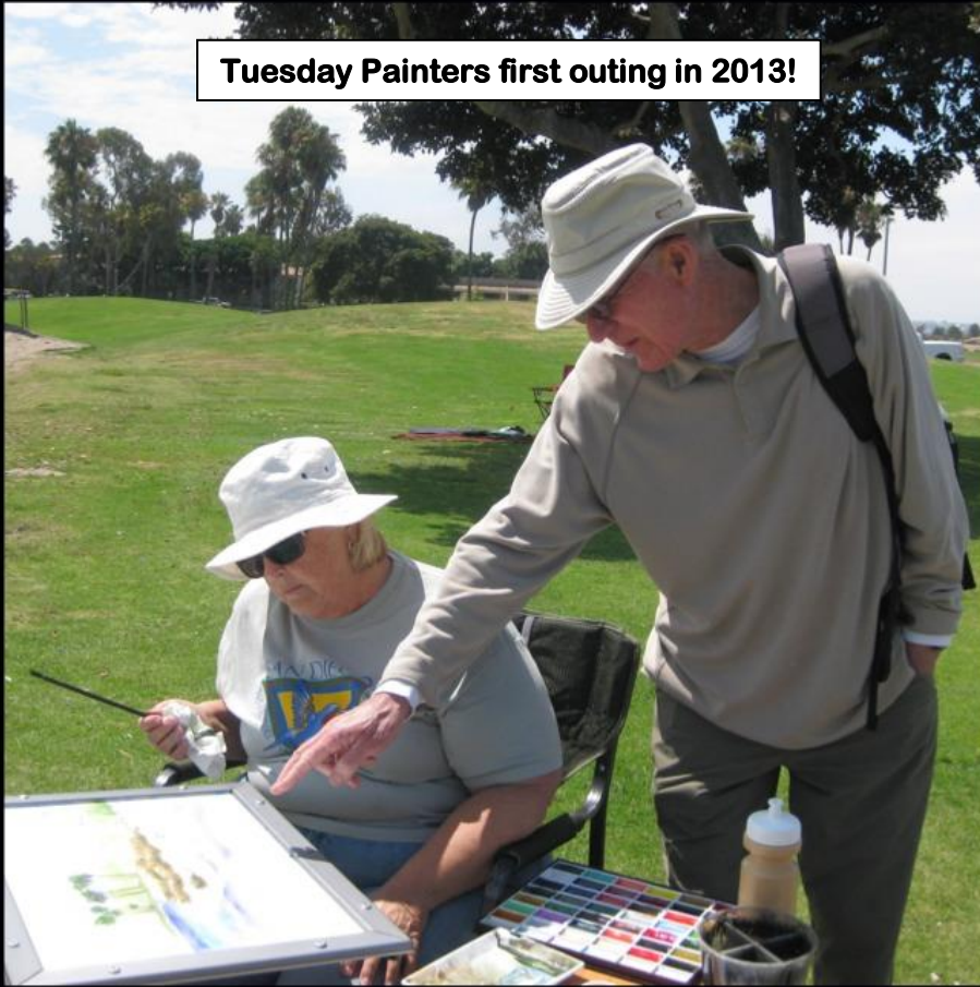
Tuesday Painters first outing in 2013!